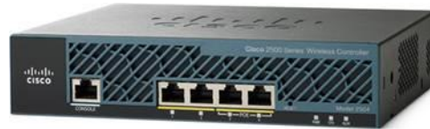
Figure 1. Cisco 2500 Series Wireless Controller

As a component of the Cisco Unified Wireless Network , this controller delivers centralized security policies, wireless intrusion prevention system (wIPS) capabilities, award-winning RF management, and quality of service (QoS) for voice and video. Delivering 802.11n performance and scalability, the Cisco 2500 Series provides low total cost of ownership and flexibility to scale as network requirements grow.